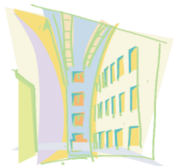
The Food Court a culinary experience

Tuesday September 8th- Tuesday December 22nd