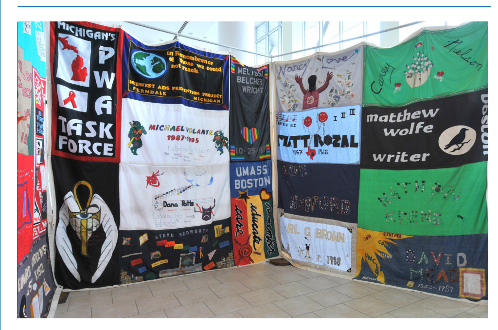
Sections of the AIDS Memorial Quilt were on display in the Campus Center in December.