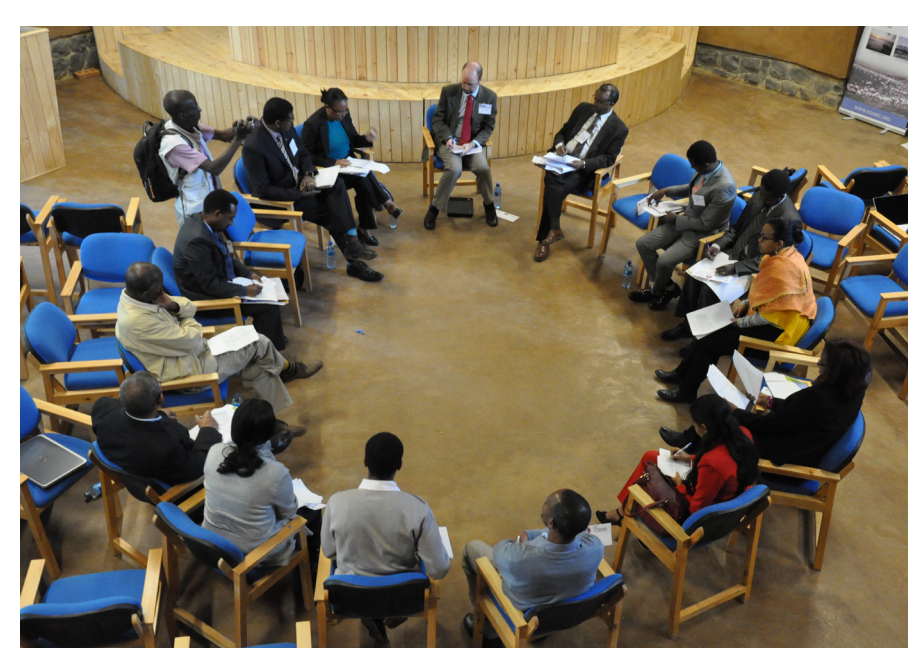
\label{lem:approx} A \ negotiation \ simulation \ held \ during \ the \ Regional \ Environmental \ Diplomacy \ Institute-Africa.