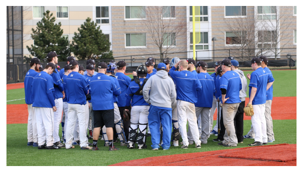
The Beacons are enjoying their first baseball season at home on Columbia Point at the newly opened J. Donald Monan, SJ Park.

In the coming months, UMass Boston looks forward to the completion of the building's recital hall, theater, 500-seat auditorium, additional classrooms, and other specialized teaching areas. The 190,000-square-foot building ultimately will provide nearly 2,000 classroom seats, faculty and staff offices, a café, student lounge and study spaces, and specialized instructional space for three academic departments: art, chemistry, and performing arts. University Hall will support the university's strategic plan to expand academic offerings and grow enrollment.