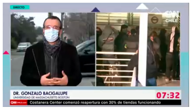
Gonzalo Bacigalupe speaks about Chile's COVID-19 cases on CNN.

This symposium examined the ways proposed responses to climate change may themselves pose environmental risks, as well as deepening existing gender, racial, and global inequalities. The event highlighted the work being done by diverse feminist thinkers to create the radical solutions that the crisis demands, proposing fundamental shifts in the dominant global economic model. The focus was on intersectional feminist analysis, with an emphasis on global justice and sustainability.