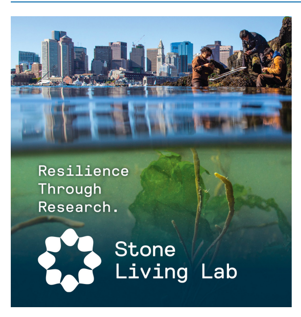
UMass Boston is a partner in the new Stone Living Lab.