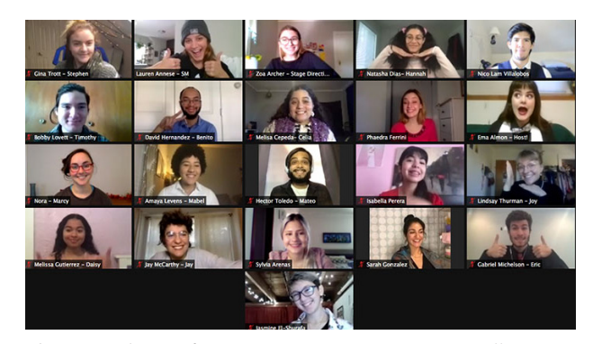
The cast and crew of New Voices, New Stories in a socially distant rehearsal.