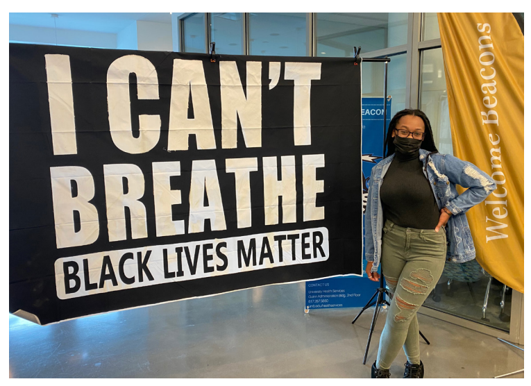
Students posed with the Black Lives Matter banner throughout the day.