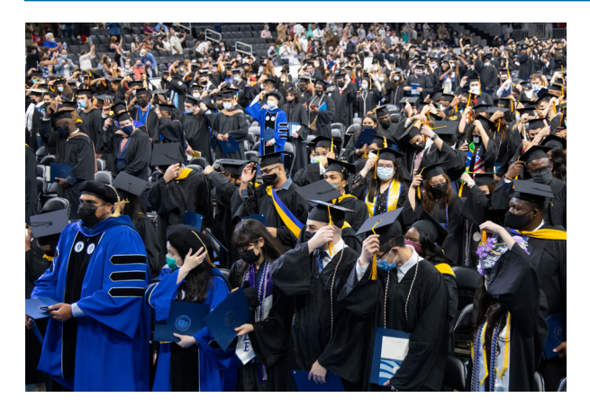
UMass Boston conferred degrees to 3,860 members of the Class of 2021 and 3,727 in the Class of 2020.