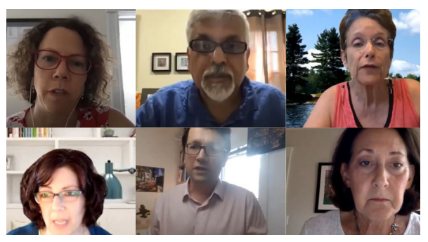
Six faculty members participate in a Teach Fall 2020 informational session.