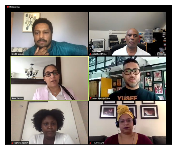
Panelists discuss how UMass Boston can address racial injustice on campus and beyond.