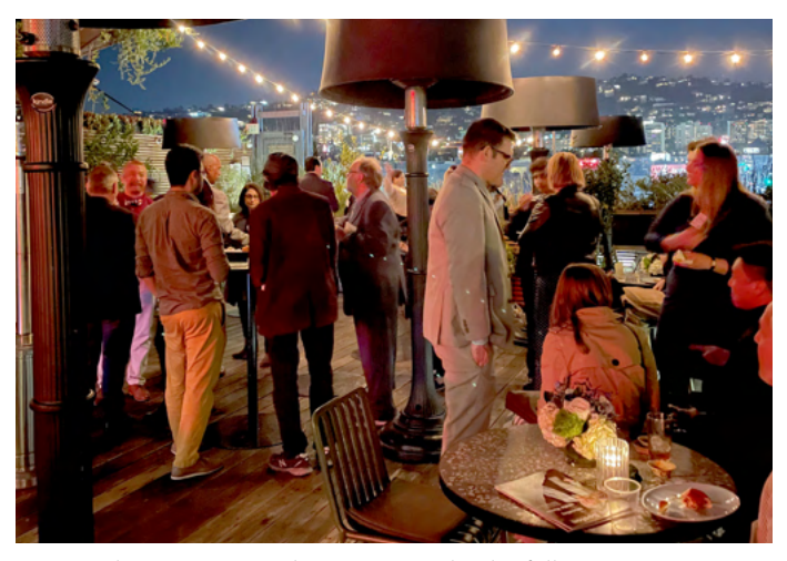
Beacon alumni came together in Los Angeles this fall.