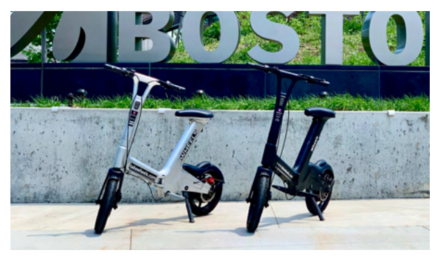
Wheels electric bikes arrived on campus on October 15.

Since undergoing major construction, the university has not had flagpoles. These flagpoles will fly the American flag, the POW flag, and the university flag to greet commuters and visitors to our campus.