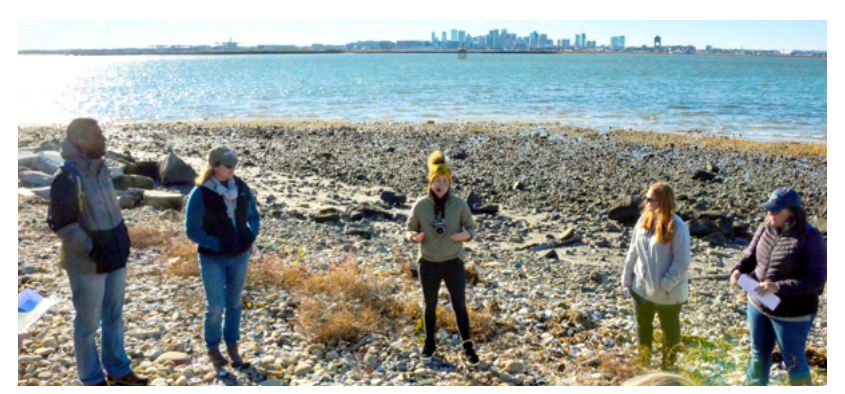
Participants learn about a shoreline restoration project at Coughlin Park in Winthrop during a conference field trip.

The report's inaugural ranking of undergraduate nursing programs vaulted UMass Boston high on the list, joining several other top-ranked programs at the Manning College of Nursing and Health Sciences. Earlier this year, U.S. News ranked the school as No. 63 on its list of best master's in nursing programs, and No. 86 on its list of best doctor of nursing practice programs.