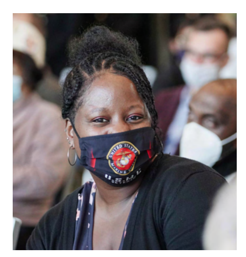
Students, staff, faculty, administrators, and service members past and present joined the Veterans Day celebration in the Campus Center.