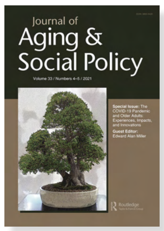
Journal of Aging and Social Policy