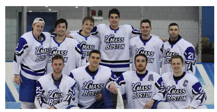
The men's hockey team earned their regular season title on Senior Night.

UMass Boston currently serves more than 650 student veterans, their family members, and guardsmen and women. The campus's Office of Veterans Affairs recruits, provides financial assistance, and guides veterans and their dependents through their higher education experience and beyond, managing $4 million in federal GI benefits.