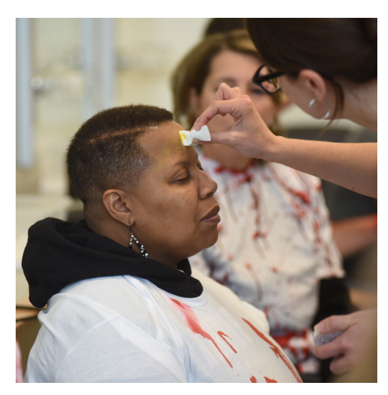
Theatre Arts students provided moulage to simulate mock injuries, providing a more realistic situation for first responders.