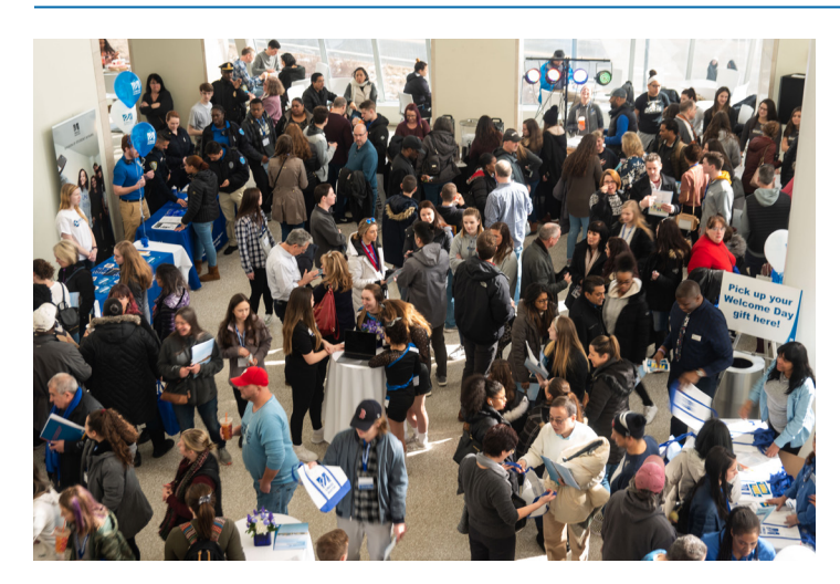
More than 1,650 admitted students and their guests came out for Welcome Day on February 23.