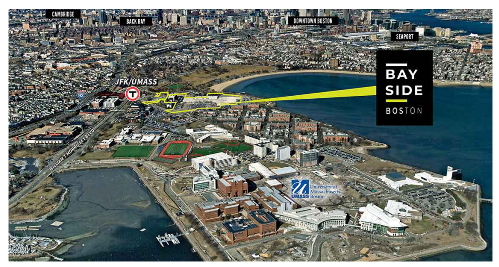
An aerial view showing the location of the Bayside Expo Center property