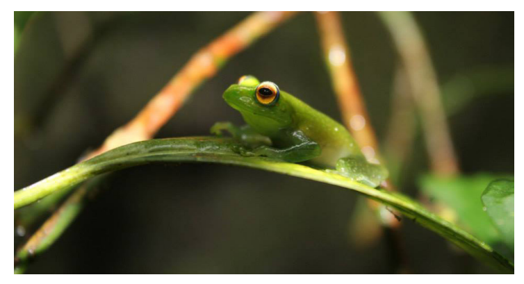
UMass Boston researchers are looking at ways to control, prevent, and fight amphibian-killing fungi.

The approximately $1.1 million grant was awarded by the Bureau of Substance Abuse Services in the Massachusetts Department of Health. INENAS and the College of Nursing and Health Sciences will partner with local tribal communities to provide life skills training to Native middle school students. The training aims to increase the students' self-esteem, decrease their stress levels, and make them more resilient in resisting drug use, including opioid use.