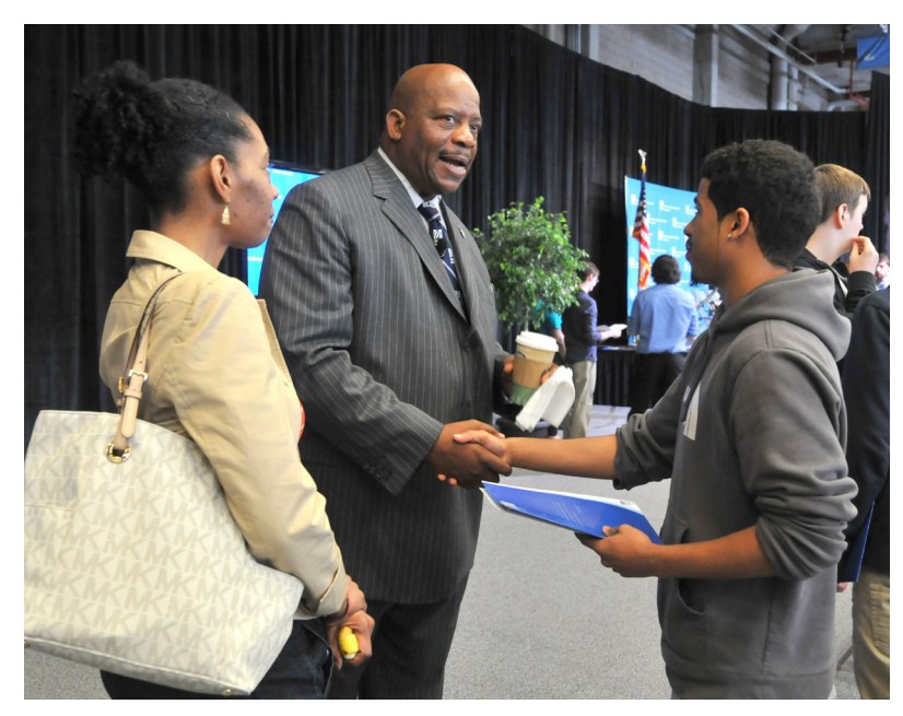
Chancellor J. Keith Motley welcomes prospective students to UMass Boston.

In addition to onsite internships, the program will include courses in topic areas such as contemporary issues in global affairs, global communications and information, foreign policy analysis, diplomacy, human security, international terrorism, and conflict resolution.