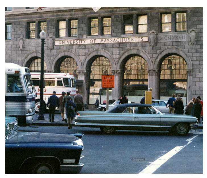
UMass Boston celebrates its 50th anniversary in 2014. Among many other commemorations of the milestone, the university is offering a look into its past on Flickr. Shown here is UMass Boston's first location, opened in September 1965, at a renovated building in Park Square in downtown Boston.

The UMass Boston chapter of ENACTUS has paired with Frost Ice Bar in Boston to collect empty liquor bottles used by the bar and up-cycle them into new products to be sold for profit. The products include an array of items such as torch lamps, lighting fixtures, vases, cheese dishes, and drinking glasses. The products are created by ENACTUS UMass Boston members and youth in the Boston community, and the profits from each sale are divided between the youth artists who helped make the products and ENACTUS UMass Boston initiatives.