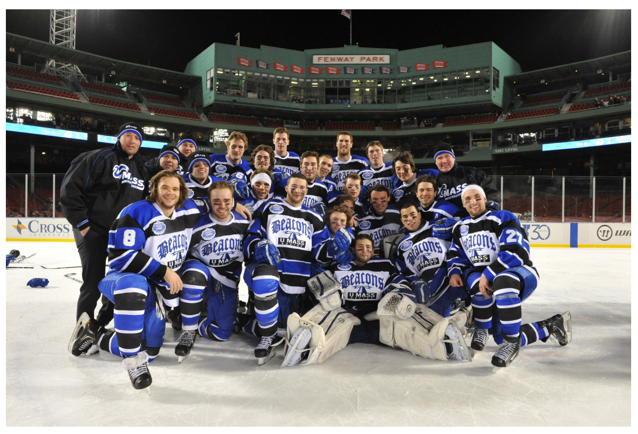
The UMass Boston Beacons celebrate their 4-2 win over Salem State University at Citi Frozen Fenway.