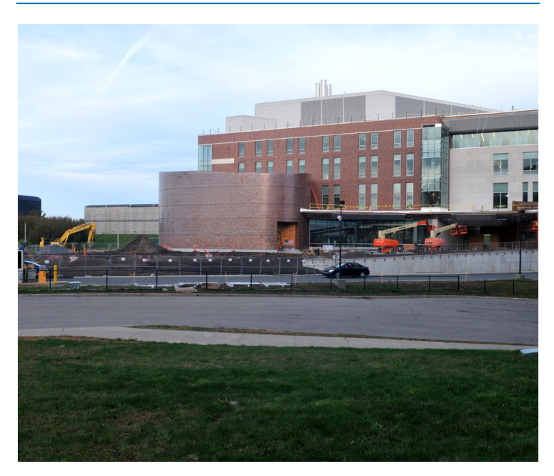
Crews continue making progress on chemistry, performing arts, and general classroom space at University Hall, which is scheduled to open in the spring.