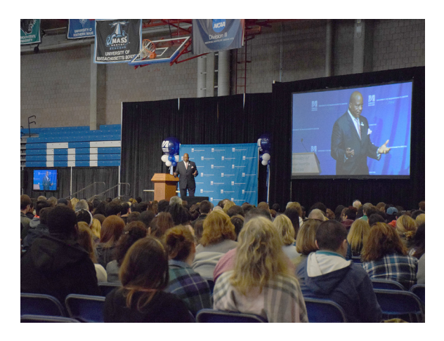
Nearly 1,600 prospective students, parents, and family members attended UMass Boston's freshman open house on October 17.

The future looks equally bright as 1,600 prospective students, parents, and family members attended UMass Boston's freshman open house on October 17 and more than 450 students from as far away as Virginia, New York, Maine, and Connecticut attended the Transfer Open House on November 5.