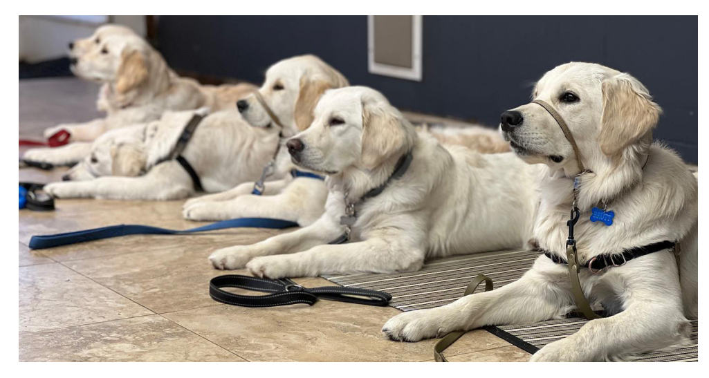
Golden Retriever dogs in training at Golden Opportunities for Independence, a Walpole-based nonprofit that UMass Boston Police is partnering with.