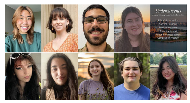
Nine first-year students had their essays published in UnderCurrents.