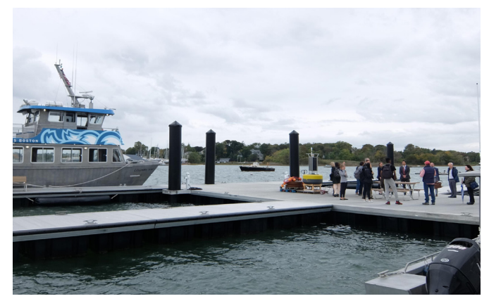
The Project BEACON grant will increase direct waterfront access for research via UMass Boston's Fox Point Dock.