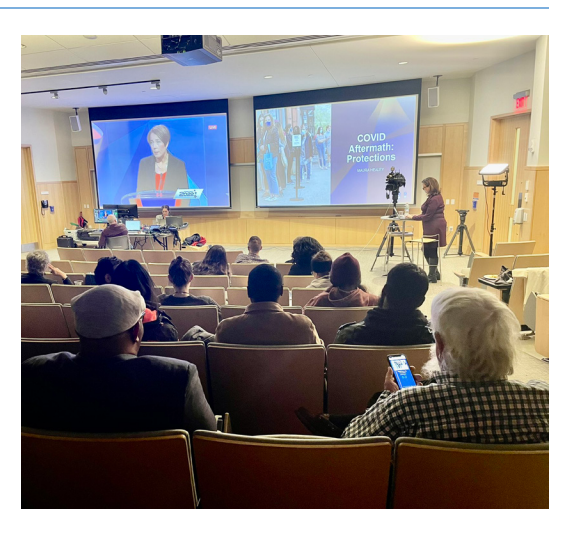
Focus group participants watch the governor's debate at UMass Boston.

"Our country has shaped generations of immigrants into proud Americans and generations of immigrants have shaped our country for the better," he said. "So now it is your turn. Channel the feelings, the emotions, the sense of pride, the joyous effervescence of the day into purpose and civility."