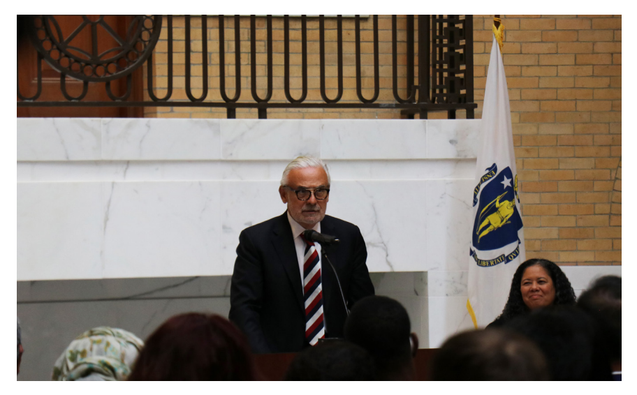
Chancellor Suárez-Orozco spoke to new citizens at a State House naturalization ceremony.