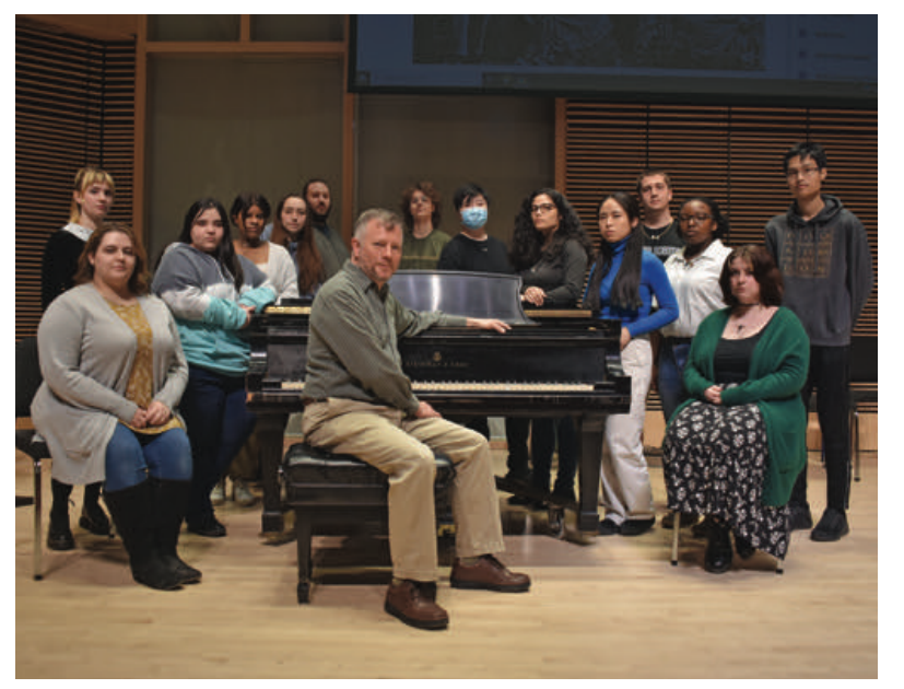
The UMass Boston Chamber Singers