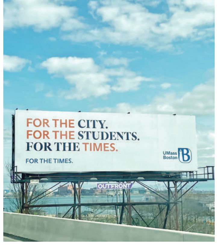
A billboard featuring the new marketing campaign.