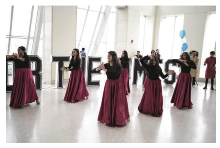
Bollywood group UMB Naach performs at the brand launch event.

Learn more about UMass Boston's new look and campaign.