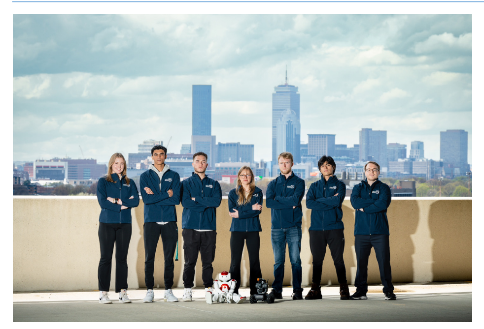
The UMass Boston robotics and engineering club