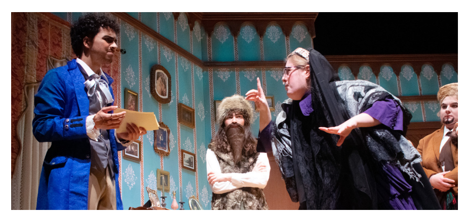
Students perform in The Government Inspector this spring.

On the non-clinical side, UHS has hired two health educators to provide prevention and response strategies programming. The Division of Student Affairs is also doing more community mental health programming, such as the UMBeWell Day and weekly interfaith mindfulness meditation sessions. Dean of Students case management for students of concern is also more robust, and the campus has additional capacity and reach in basic needs support provided by U-ACCESS. These upgrades have reduced wait times for non-emergency follow-up appointments in the Counseling Center, improved provider-to-patient case ratios, and strengthened the community's approach to mental health and wellbeing initiatives.