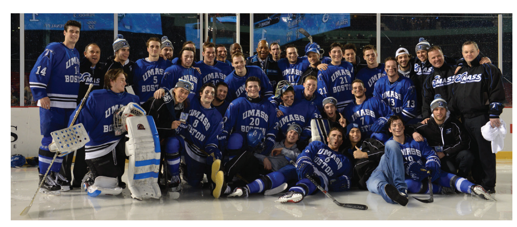
The Beacons men's ice hockey team celebrated their win at Frozen Fenway in January.

For the fourth consecutive year, UMass Boston is one of the silver award recipients on Victory Media Inc.'s Military Friendly School list, for being a leader in the recruitment and retention of students with military experience. The Office of Veterans Affairs serves nearly 675 students each year, many of whom are nontraditional or first-generation college students. About 100 veterans graduate each year. The department moved into reconfigured space in the Campus Center last fall, creating a single destination where student veterans can find the resources they need to thrive at UMass Boston.