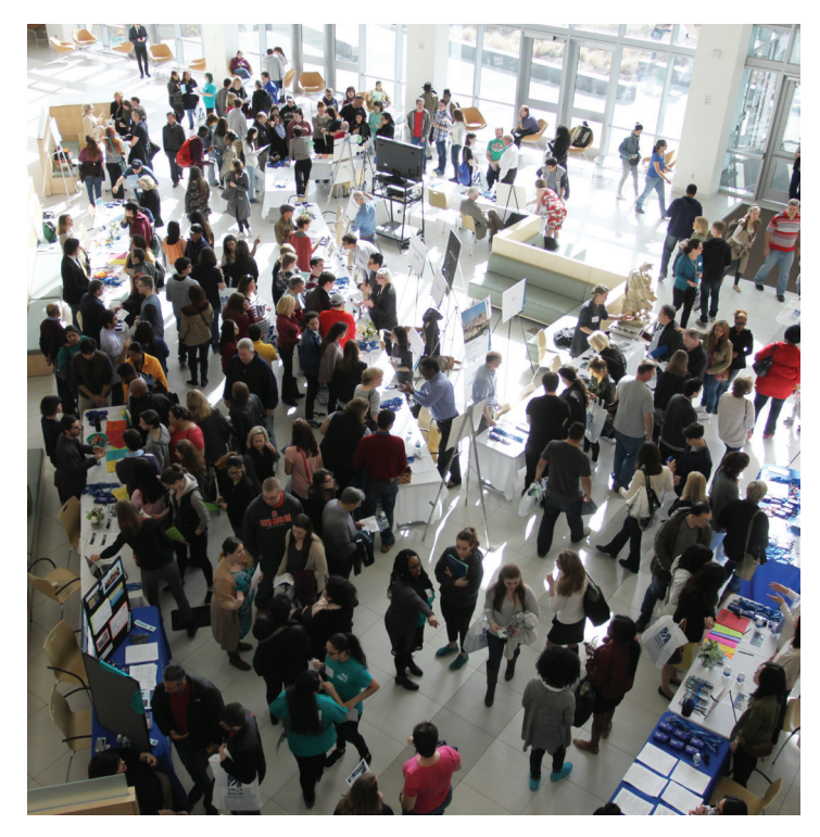
Accepted students and their families received information about programs and majors during Welcome Day.