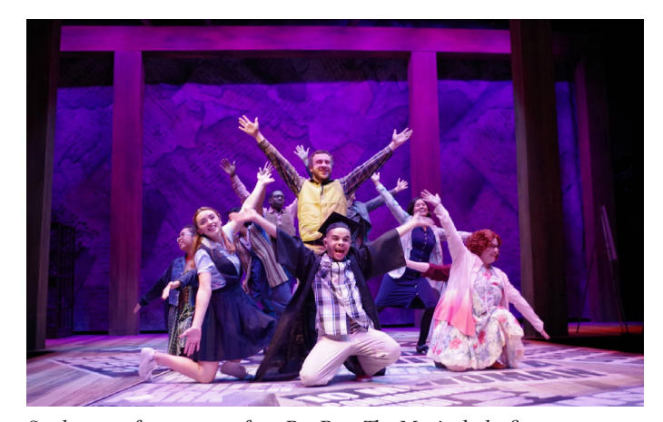
Students perform a scene from Bat Boy: The Musical, the first production at the new University Hall Theatre.

All online courses, certificates, and degree programs are administered by the College of Advancing and Professional Studies in partnership with the colleges housing the disciplines in question.