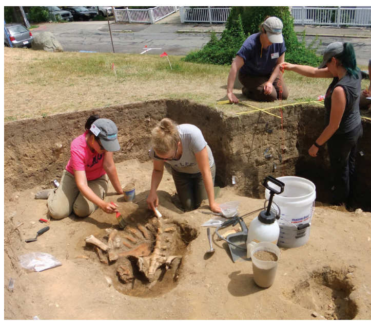
UMass Boston students uncovered the skeleton of a calf they later named Constance at the Plymouth settlement.