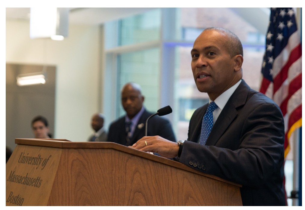
Governor Patrick speaks about his administration's investment in public higher education building projects, including the Integrated Sciences Complex at UMass Boston.