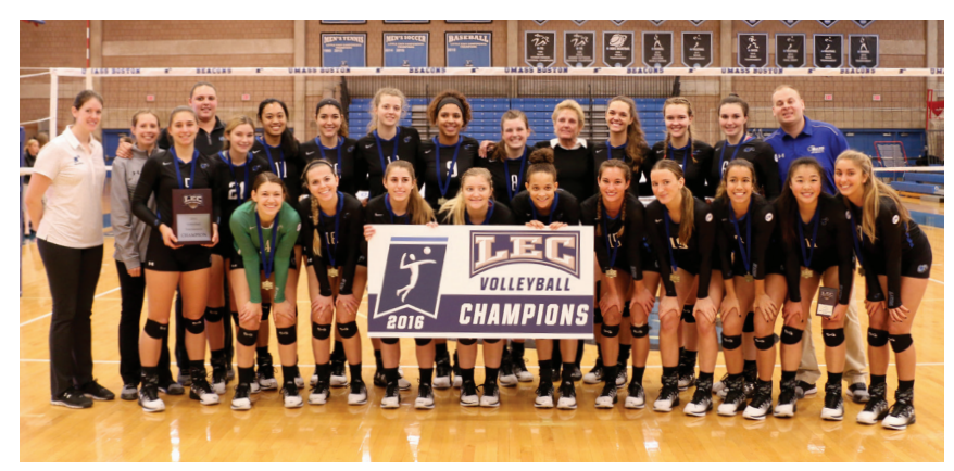
The Beacons women's volleyball team won their seventh LEC Tournament crown this month in the Clark Athletic Center Gymnasium.