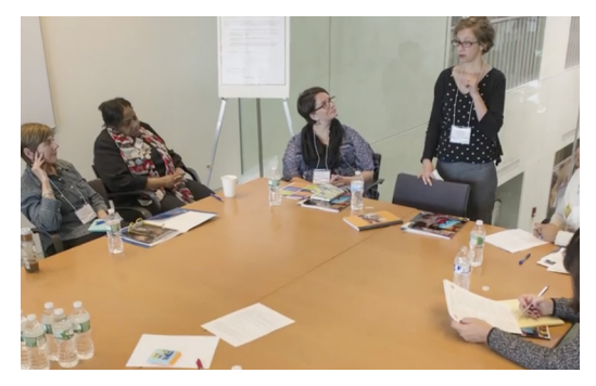
UMass Boston's Institute for Early Education Leadership and Innovation was awarded a $100,000 grant to launch its innovation accelerator.

With this award, the institute will launch its first-in-the-nation innovation accelerator for early educators. They will also be able to reach more child-care business owners and early educators with entrepreneurial leadership training, and equip them to lead