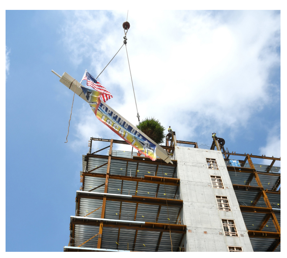
The final steel beam is lifted into place above UMass Boston's first residence hall.