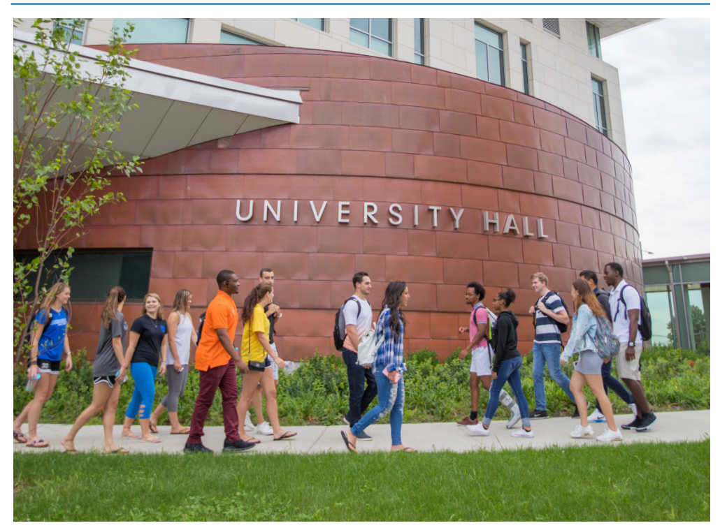
Students walk to class outside the new University Hall.