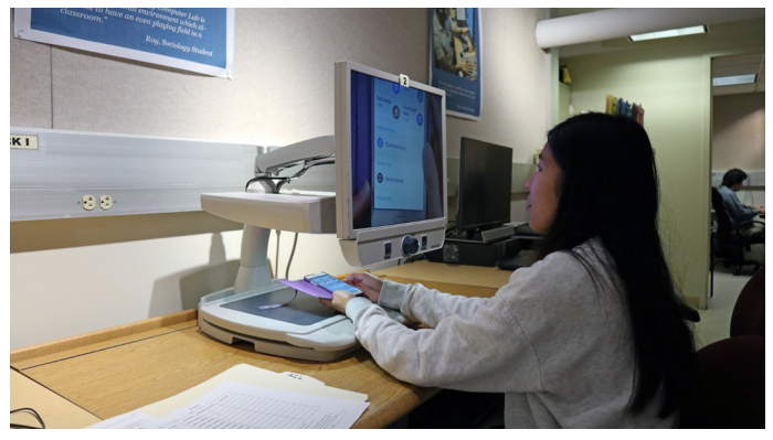
A student demonstrates how those with low vision can use assistive technology to get a magnified view of their smartphone screens.

Through recruitment, marketing, and strategic financial aid, the first residential class of UMass Boston students includes more than 20 percent Pell-eligible students, who have an average family income of $33,592. The awards, which ranged from $5,000 to $8,600, will help families afford the costs associated with the meal plan required of residential students and potentially some of the cost of housing. This financial support will enable students to fully engage in the living and learning opportunities now available at UMass Boston.