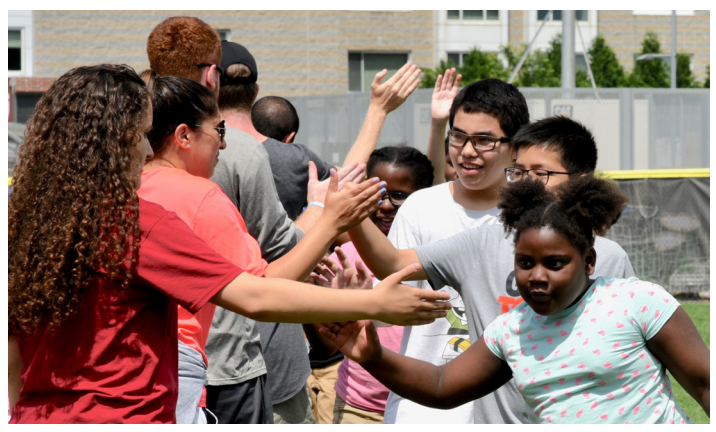
Since 2006, UMass Boston's Camp Shriver has welcomed more than 1,500 children to a free, inclusive summer sports camp.

The Sport Leadership and Administration BA is designed for those of diverse backgrounds looking to coach, become an athletic director or team owner, get into sports marketing or sports broadcasting, or explore many other aspects of the sport industry, including finance, social media, and event management. A distinguished advisory board of sports legends will help to guide the program and develop internships for the students.