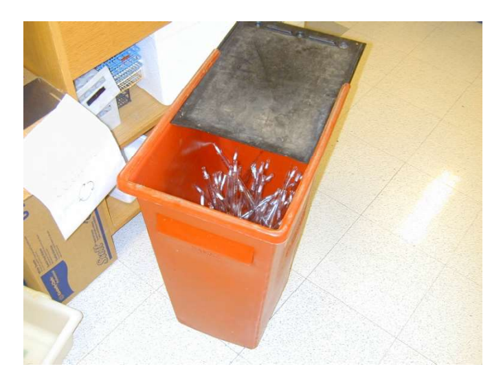
Figure 4.3 Sharps Container

To protect yourself and others from injury from sharps, place all needles, Pasteur pipettes, syringes, suture needles, scalpels, and razor blades into standard sharps containers. Large volumetric/serological pipettes, or other items that can puncture biohazardous red bags should be disposed of in Sharps Boxes. Please do not dispose of sharps that may contain mercury or other metals in sharps containers. Contact OEHS for proper disposal instructions. Sharps containers must be red, fluorescent orange or orange-red leak proof, rigid, puncture-resistant, shatterproof containers that that are marked prominently with the universal biohazard warning symbol and the word "Biohazard" in a contrasting color. Place sharps containers in convenient locations near work areas so they will be used. Do not overfill the sharps containers. Contain any non-sharps waste. Contact OEHS for full sharps container pick up.