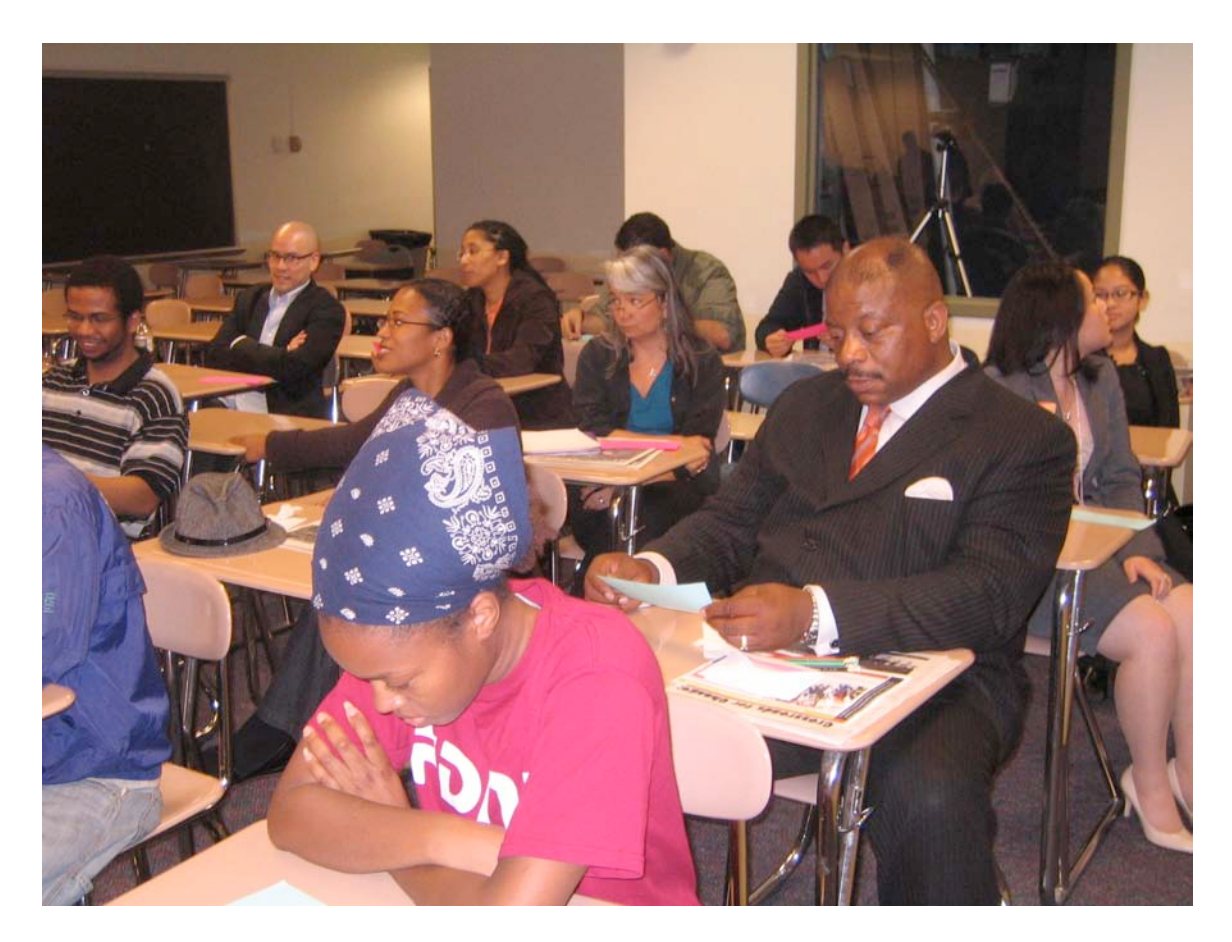
AsAmSt 326 Multiracial Experiences course project exhibitions, May 2009