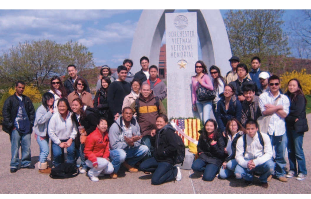
Works from the AsAmSt 223L Asians in the U.S. Spring 2008 class University of Massachusetts Boston