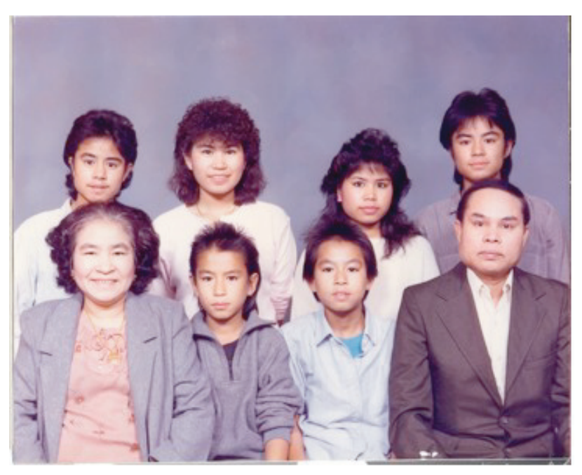
This is a family portrait of my grandparents, mother, aunt (missing another aunt), and uncles when they arrived in the U.S. in 1979 after being sponsored by a church in Newton, Massachusetts.