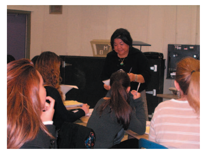
Sharing reflections from her JALD trip with students in AsAmSt 228L, February 2009

The trip lasted just 10 days, and it's been about a month since I returned to my present home in Boston. But I think often about what I experienced; it made an indelible impact on me. On a very personal level, it allowed me to connect with the homeland of my grandparents and to have a better sense of where they came from. On a professional level, as a member of the Japanese American Leadership Delegation and as a Nikkei, I now understand fully how person-to-person relationships can promote better understanding between the U.S. and Japan and will seek out opportunities to collaborate with other Japanese Americans in forging and strengthening bonds with our friends in Japan.