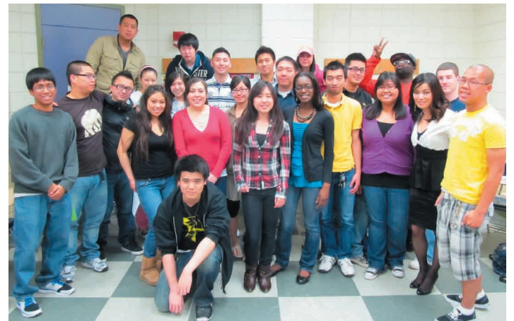
Spring 2011 AsAmSt 370 class

To celebrate Asian American Pacific Islander Heritage Month on campus, the Asian American Studies Program's 2011 Asian American Digital Storytelling Festival presented 22 new digital stories — all written, edited and directed by UMass Boston students in the AsAmSt 370 Asian American Media Literacy class of Spring 2011. As in the prior six years, these new stories featured a diverse range of topics, styles, and cultures. Using their personal and family histories as sources — and being their own research project — students have experienced what we now refer to as “370 moments” and reflected on many issues and subjects, including: relationships, love, migration, war, identity, transnationality, community, and more... Each of the digital stories featured is a culmination of AsAmSt students' research and reflections throughout the semester.