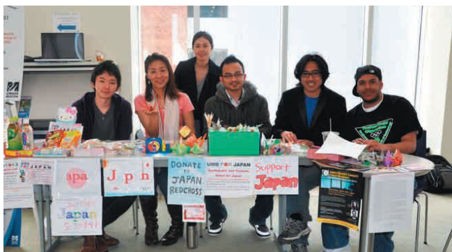
Students at UMass Boston

International students from Japan and elsewhere in Asia as well as around the globe have played important roles in the Asian American Studies Program throughout the past two decades. Our alumni are worldwide. We remember and reconnect, especially during traumatic times like March 2011 and beyond.