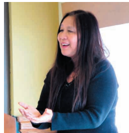
Marilyn Chin