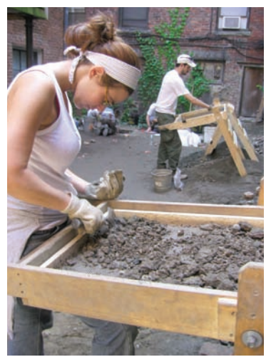
ARCHAEOLOGY STUDENTS DIG AT THE AFRICAN MEETING HOUSE

We advanced a plan to create a research cluster in neuropsychology and developmental psychology.