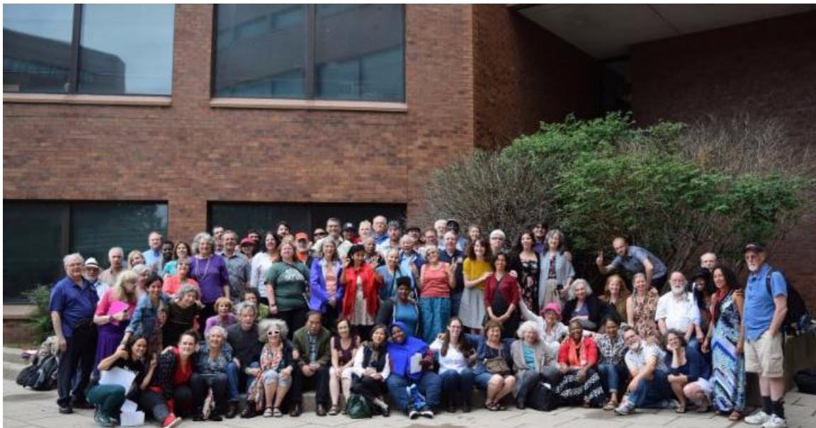
Faculty and participants from the 2017 Writers' Workshop

(Click for photos from the 2017 Writers Workshop)