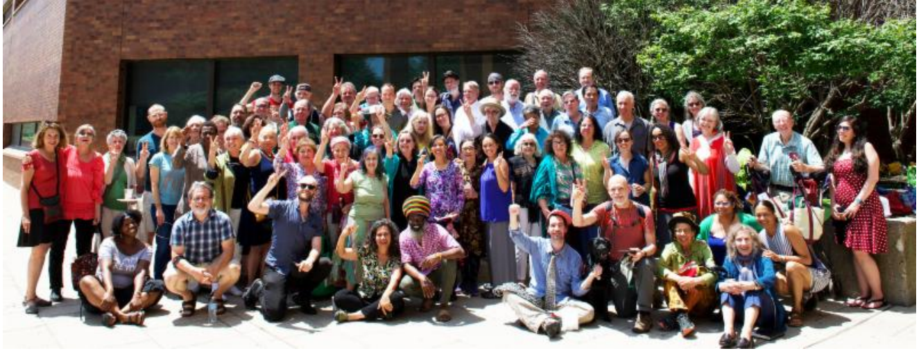
Faculty and participants from the 2018 Writers' Workshop