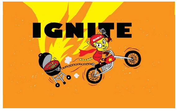
Ignite Festival in Somerville

"IGNITE! A Global Fire and Food Festival" brings you an evening of international eats, fire throwers, roving entertainment, and a raucous celebration of global culture! Get to know the diverse and exciting Somerville community just outside of Boston, and try lots of delicious food. It gets dark earlier now, but Ignite will light up your night!